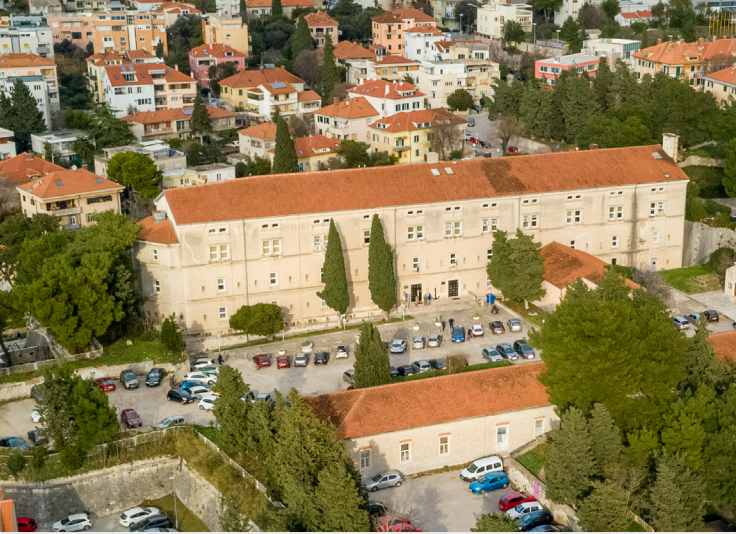
Underwater Heritage Showroom At Croatian Maritime Museum Split