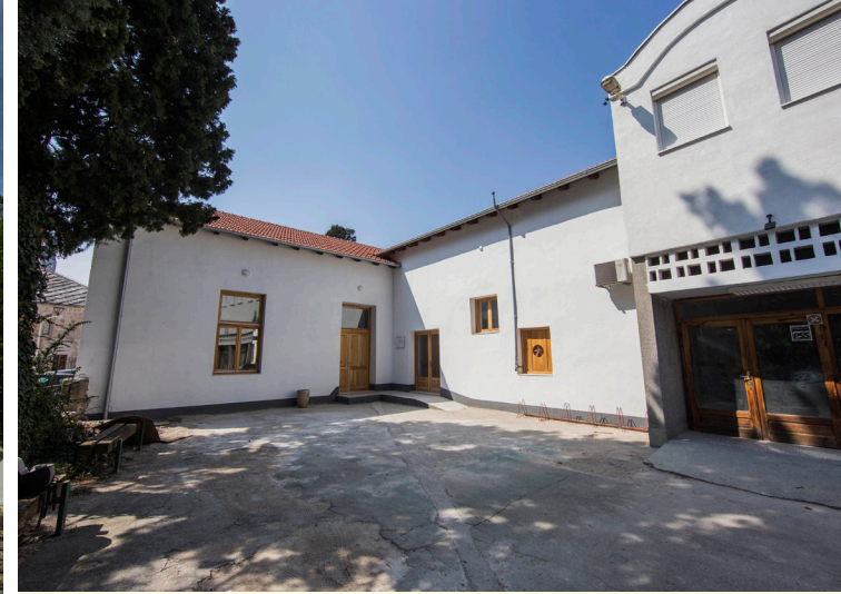
Underwater Heritage Showroom At "Brodari" Building In Mostar