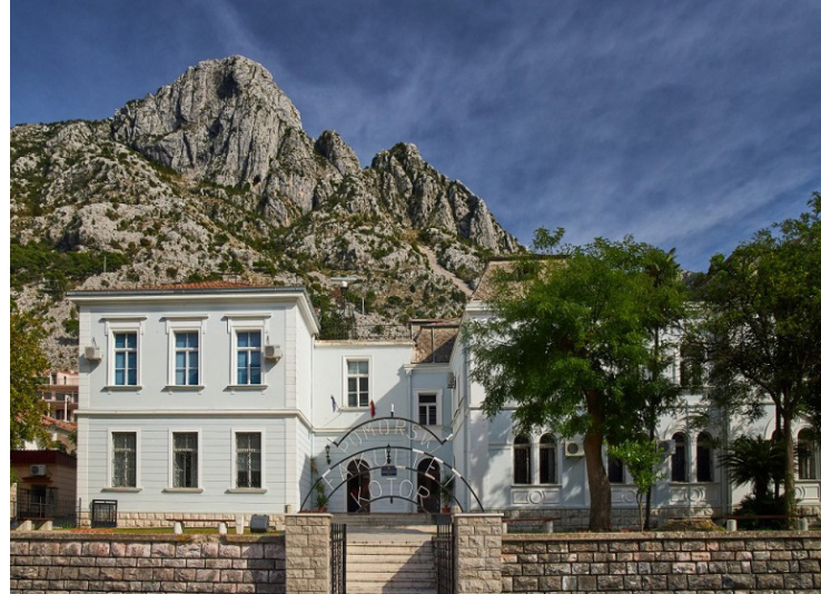
Underwater Heritage Showroom At Faculty Of Maritime Studies Kotor